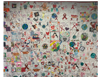
HIV Tapestry hanging in Caring Together

In 1996, York City dedicated a Garden of Serenity and Hope as a memorial for those lost to AIDS and in honor of those living with HIV/AIDS. This beautiful garden is located in Albemarle Park in York City. Every year, we host recognition events at the garden in conjunction with World AIDS Day on December 1.